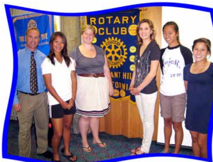
Pictured above, from left to right: