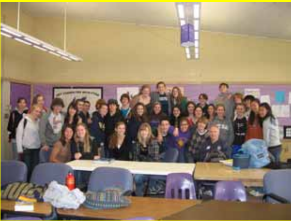
College Park Interact Club Look how we've grown this year!