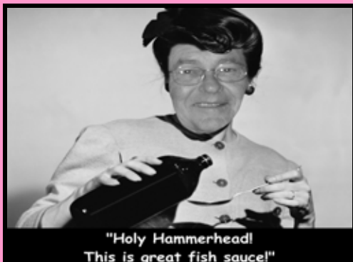
"Holy Hammerhead! This is great fish saucel!"

THIS WEEK – SPECIAL APPEARANCE MEET PREZ STEVE'S FAMOUS MOTHER-IN-LAW